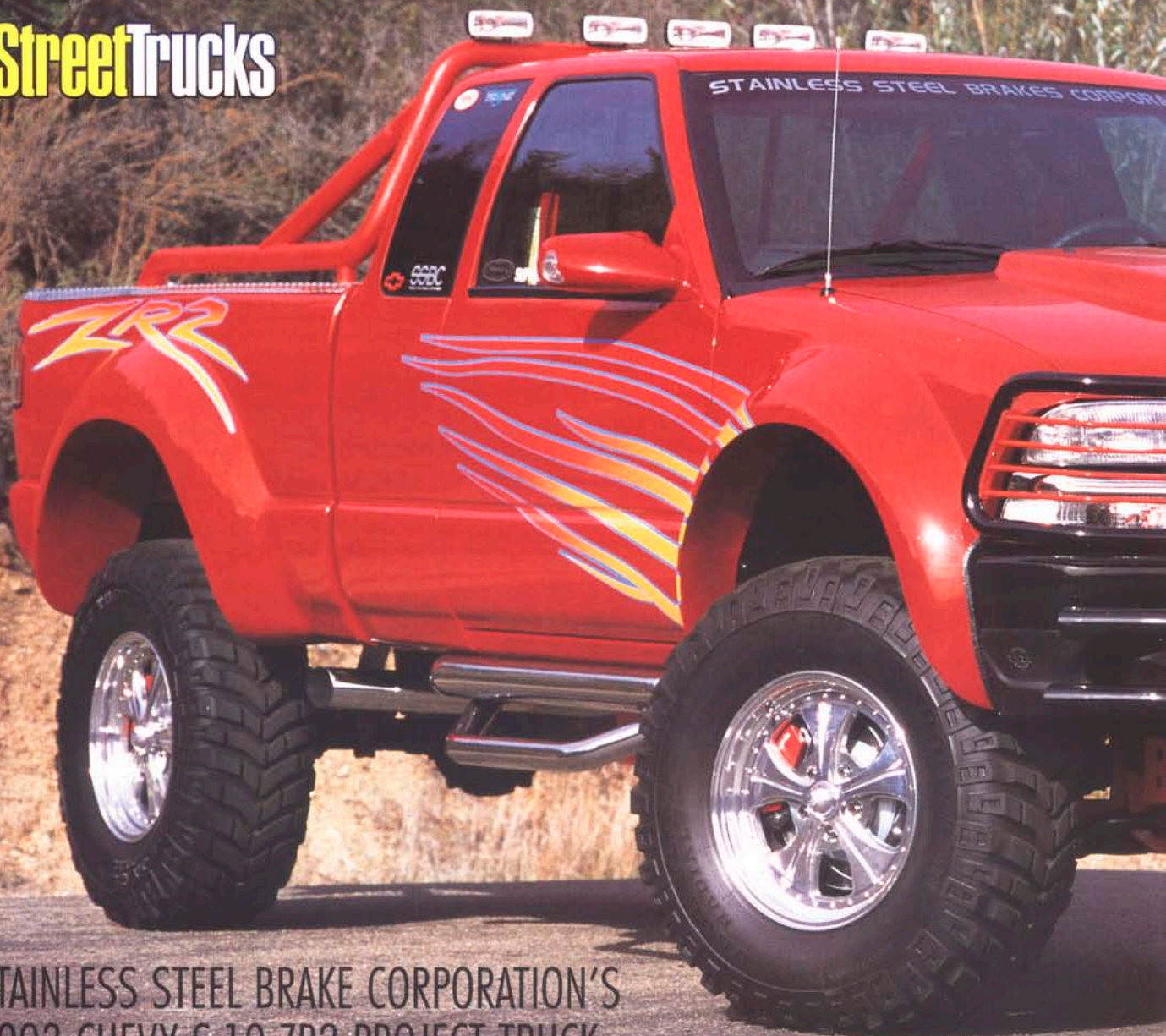
STAINLESS STEEL BRAKE CORPORATION'S 2003 CHEVY S-10 ZR2 PROJECT TRUCK